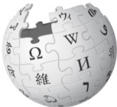
Figure with caption